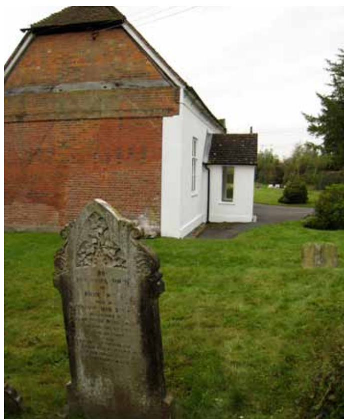
The Old Meeting

Tadley Community Primary School (1877) and the Priory Primary School (1850), both rated 'outstanding' in their most recent OFSTED reports; earlier 19th century schooling in a Dame School or at Sunday School; previous generations mostly unschooled and illiterate, though a British School existed at the Old Meeting circa 1842. Burnham Copse Primary School (1956) and Bishopswood Infant and Junior Schools (1972) were provided for AWE workers' children. Many Tadley children receive their secondary education (from 11 to 16) at The Hurst Community College in Baughurst (1957), a 'specialist science' school.