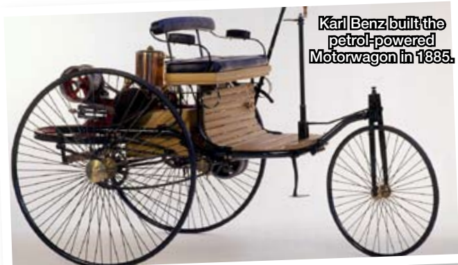
Karl Benz built the petrol-powered Motorwagon in 1885.