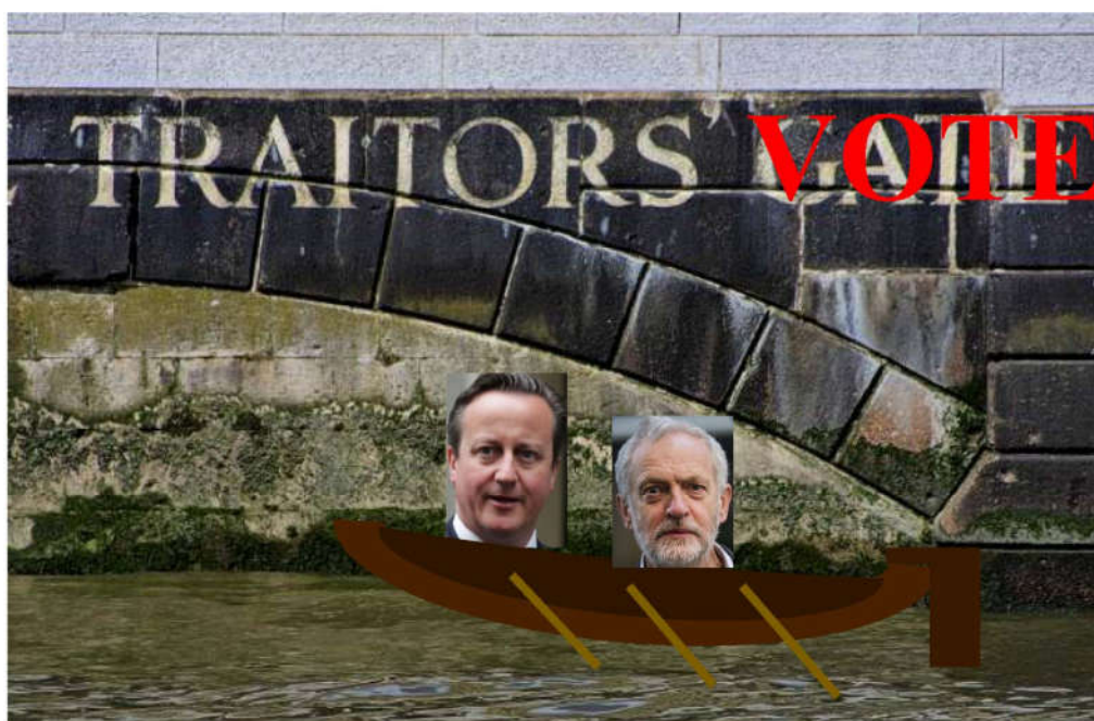
Tower of London Polling Station, REMAIN entrance. Shown arriving are Tory leader David 'Quisling' Cameron, left, and Labour leader Jeremy 'Turncoat' Corbyn 4 .

There is only one place for Prime Minister Cameron and the leader of the opposition, Jeremy Corbyn – 40 years a Eurosceptic, yet newly minted as a Europhile when Labour party unity demanded it – and the other leaders of the REMAIN campaign and that is the Tower of London. Given the unlikelihood of prosecution, however, the place could at least be provided with a ballot box.